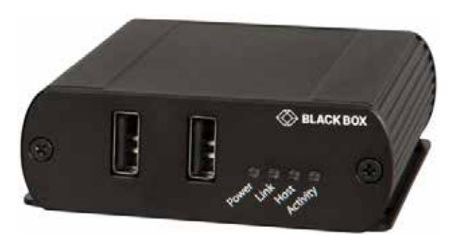
IC402A-R2, remote unit