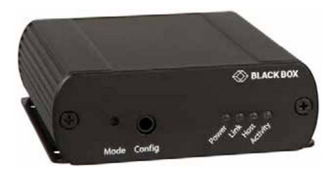
IC402A-R2, local unit